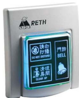
Door bell、Clean、 Do not Disturb (Outside)