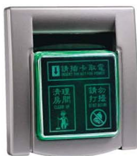
Save energy、Touch panel (Inside)